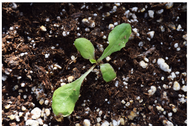
Figure 2. Prickly lettuce seedling with cotyledons (small and rounded) and first true leaves.