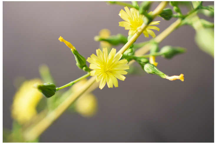
Figure 5. Close-up of prickly lettuce flower heads composed of only ray flowers.