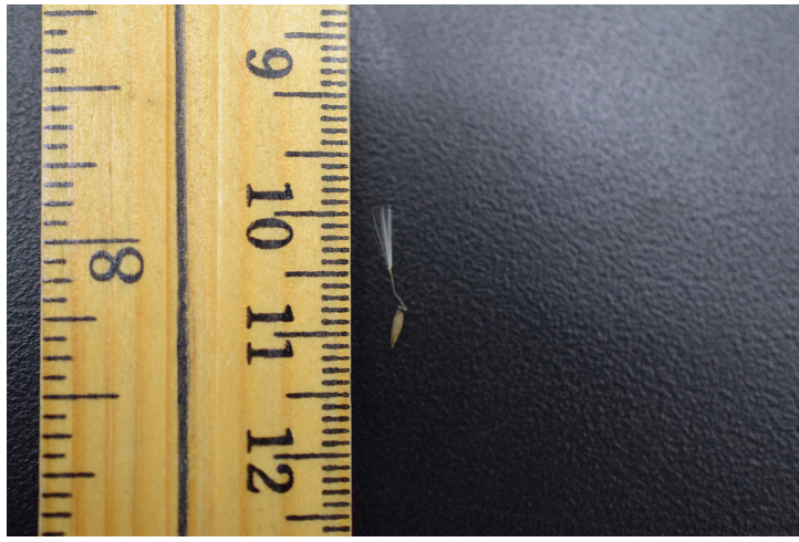
Figure 6. Prickly lettuce seeds are about 1/8 inch long and contain a pappus, a parachute-like structure that aids in wind dissemination of seeds.

After emergence, a rosette is formed and a long taproot develops. Plants that emerge in the fall will overwinter as rosettes and produce one or more flowering stems in late spring or early summer. Individual plants can produce from 35 to 2,300 flowers. Each flower head contains an average of 20 seeds, giving an estimated seed production of 700 to 46,000 seeds per plant. Prickly lettuce seeds survive in the soil for only one to three years.