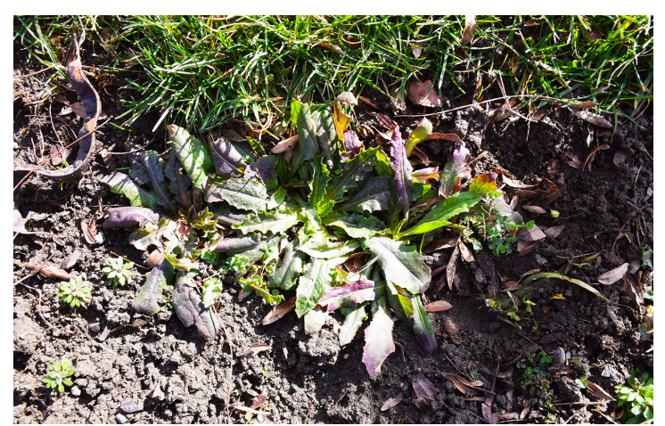
Figure 3. Prickly lettuce seedlings form a basal rosette.