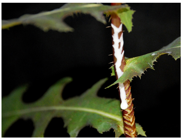
Figure 1. Prickly lettuce produces a milky sap, which is evident when a stem or leaf is damaged, that contains both latex and rubber.

The cotyledons, also known as the seed leaves, are broad and oval in shape (Figure 2). Subsequent seedling leaves are similar in shape, pale green, papery thin, and cupped or curved upward at the outer ends (Gaines and Swan 1972). The seedling leaves form a basal rosette: outward radiating leaves from a short stem at soil level (Figure 3).