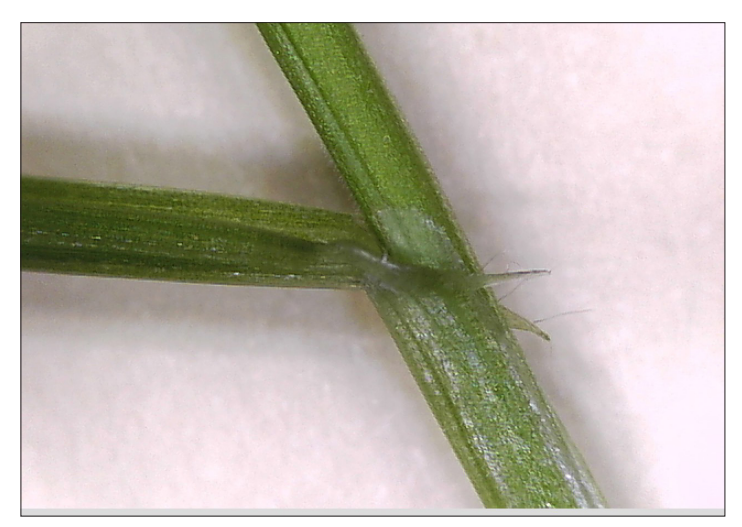
Figure 5. Winter wheat seedlings have sharply curved auricles that while present early in feral rye, often wither and are hard to see.