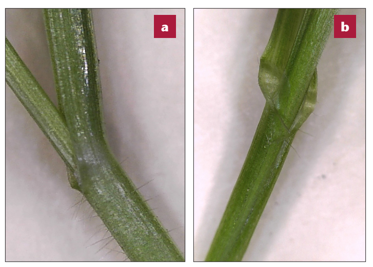
Figure 4. The stems of feral rye seedlings (a) often have numerous fine hairs, while wheat stems (b) tend to have few or no hairs.

Figure 3. When emerging at the same time, feral rye seedlings (left) are often larger and more robust than winter wheat seedlings (right). Feral rye seedlings may also be more reddish in color than wheat seedlings.