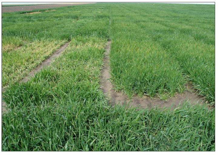
Figure 7. Tolerance of 1-gene (left) and 2-gene (right) Clearfield wheat cultivars to Beyond herbicide applied at 12 ounces per acre with MSO (two times the maximum labeled application rate; allowed for research demonstration only. Growers must follow the labeled rate requirements).

Another option for controlling feral rye in winter wheat is to apply glyphosate with a rope-wick applicator. The feral rye should be 10–12 inches taller than the wheat for best