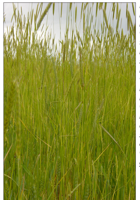
Figure 8. Feral rye is usually easy to locate in a winter wheat field after the boot stage because of its tall stature relative to most winter wheat varieties. The height differential between winter wheat and feral rye also provides an opportunity for selective chemical control with a ropewick application of glyphosate.