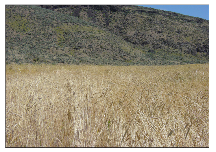
Figure 1. Feral rye is a troublesome winter annual grass weed in Pacific Northwest winter wheat–fallow production regions.

Feral rye persists as a weed because it typically matures, and most of its seed shatters, before winter wheat harvest. The presence of feral rye in wheat grain may result in dockage and other losses in wheat quality leading to grade reduction. Millers and bakers avoid buying wheat contaminated