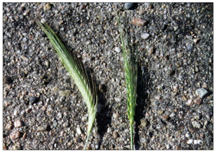
Figure 2. Feral rye seed heads (left) are slender, longer, and somewhat nodding compared to winter wheat seed heads (right).

In eastern Oregon, feral rye populations of 18 plants per square foot reduced winter wheat yield by 33 percent when allowed to compete with winter wheat until February, and 69 percent when allowed to compete with winter wheat until grain harvest in July (Rydrych 1977). In northeastern