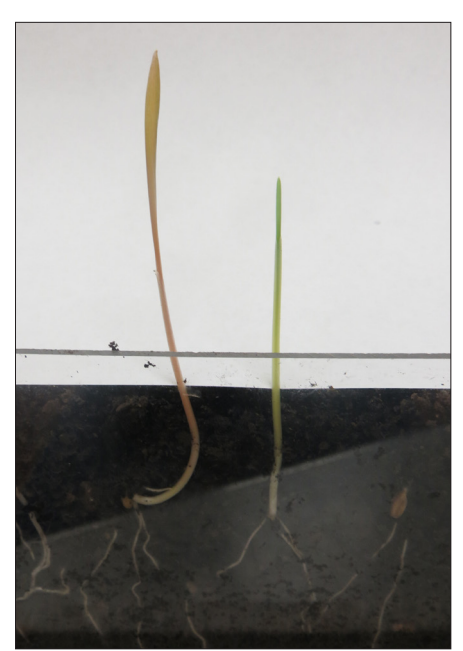
Figure 3. When emerging at the same time, feral rye seedlings (left) are often larger and more robust than winter wheat seedlings (right). Feral rye seedlings may also be more reddish in color than wheat seedlings.

It can often be difficult to distinguish feral rye seedlings from wheat seedlings. When both seedlings emerge at the same time, the feral rye are often slightly larger than the wheat (Figure 3). Feral rye seedlings also tend to be somewhat reddish in color compared to the light green of wheat seedlings. The stems of feral rye typically have many fine hairs, while wheat stems have few hairs (Figure 4). A